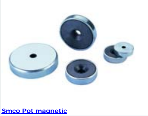
Smco Pot magnetic