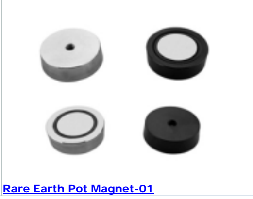
Rare Earth Pot Magnet-01