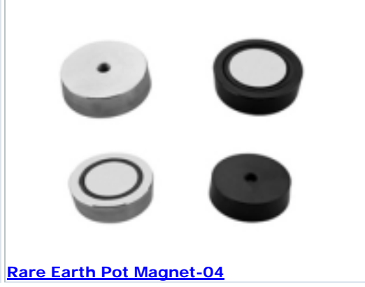
Rare Earth Pot Magnet-04