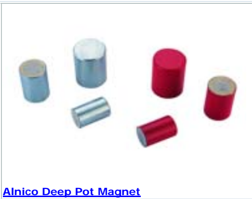
Alnico Deep Pot Magnet