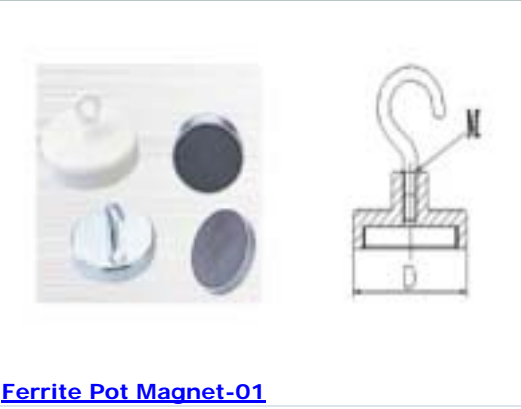
Ferrite Pot Magnet-01