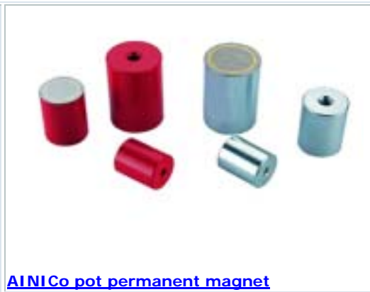
AlNiCo pot permanent magnet