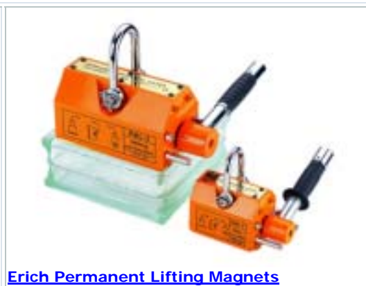
Erich Permanent Lifting Magnets