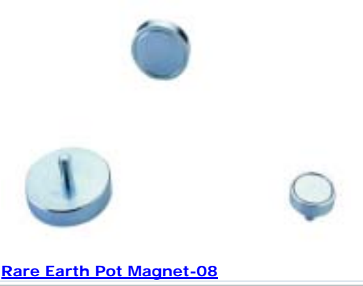
Rare Earth Pot Magnet-08