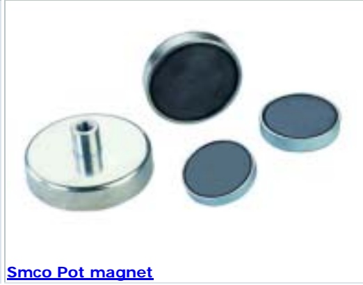
Smco Pot magnet