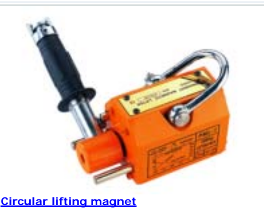
Circular lifting magnet

When selecting magnet assemblies, consider the environment in which the assembly will be used, like temperature. What is the holding force needed based on the size and weight of the parts involved and how will the assembly be secured, whether bolted, mounted, fastened or adhered? Also, consider the shape of the magnet desired (e.g. disc, ring, rectangle, etc.) and the size, including diameter, length, width and height. Knowing what variation in dimensions is allowed (tolerances) is important. Price and quantity are also considerations