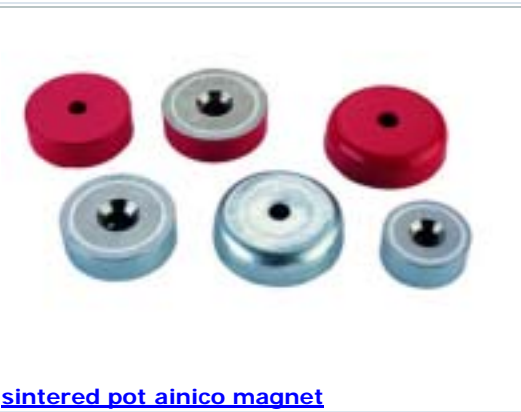
sintered pot ainico magnet