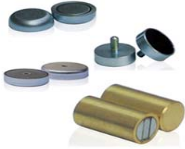
SmCo Pot magnets